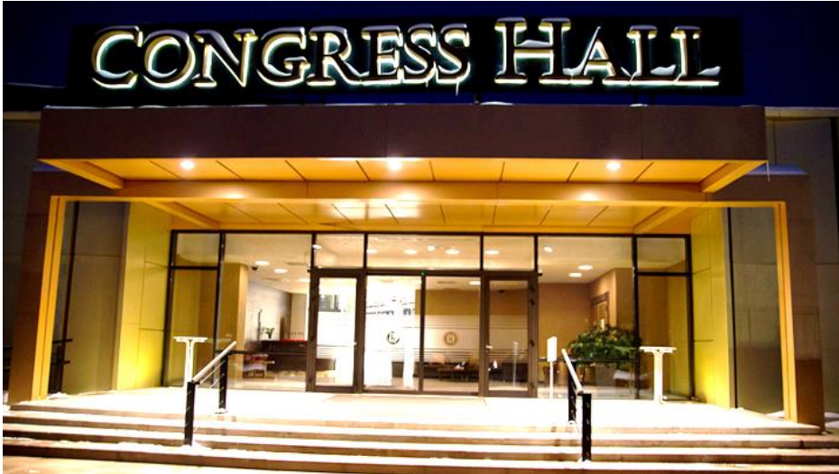
PALAS Congress Hall